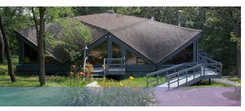
One of the unique classroom buildings at our beautiful Wisconsin campus.

Monthly weekend learning sessions are conducted at the University's campus on the Prairie Springs Woods Conference and Retreat Center near Elkhorn, Wisconsin. In-person attendance is highly encouraged but optional. The address is N7698 County Highway H, Elkhorn, WI, 53121.